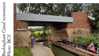
Buckingham Canal restoration

Our four founder trustees between them have huge experience on and around the canals of Milton Keynes.